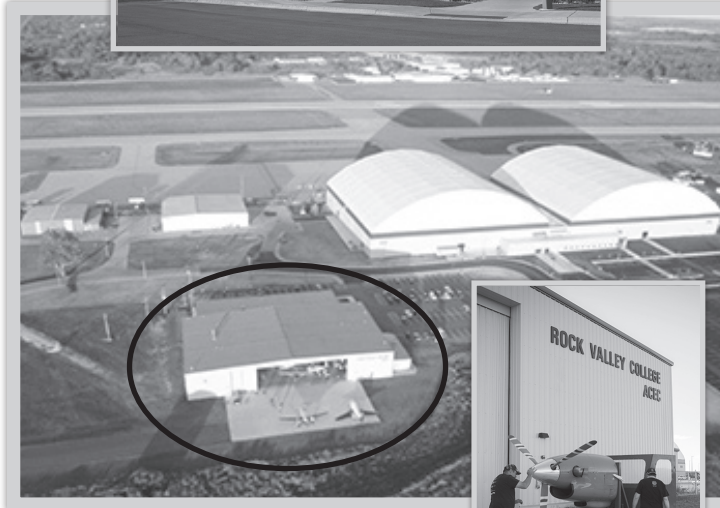
Aviation Career Education Center (ACEC) located at 6045 Cessna Drive, Rockford, IL 61109 near the Chicago-Rockford International Airport