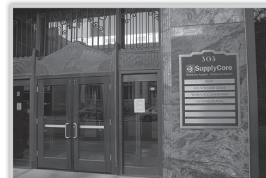
Work Force Connections located at 303 N. Main Street (Supply Core Building) Rockford, IL 61101 on the northeast corner of N. Main & Jefferson Streets