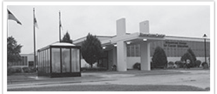
Stenstrom Center for Career Education (SCCE), formerly Samuelson Road Center (SAML) located at 4151 Samuelson Road, Rockford, IL 61109 just east of Rockford Jefferson High School